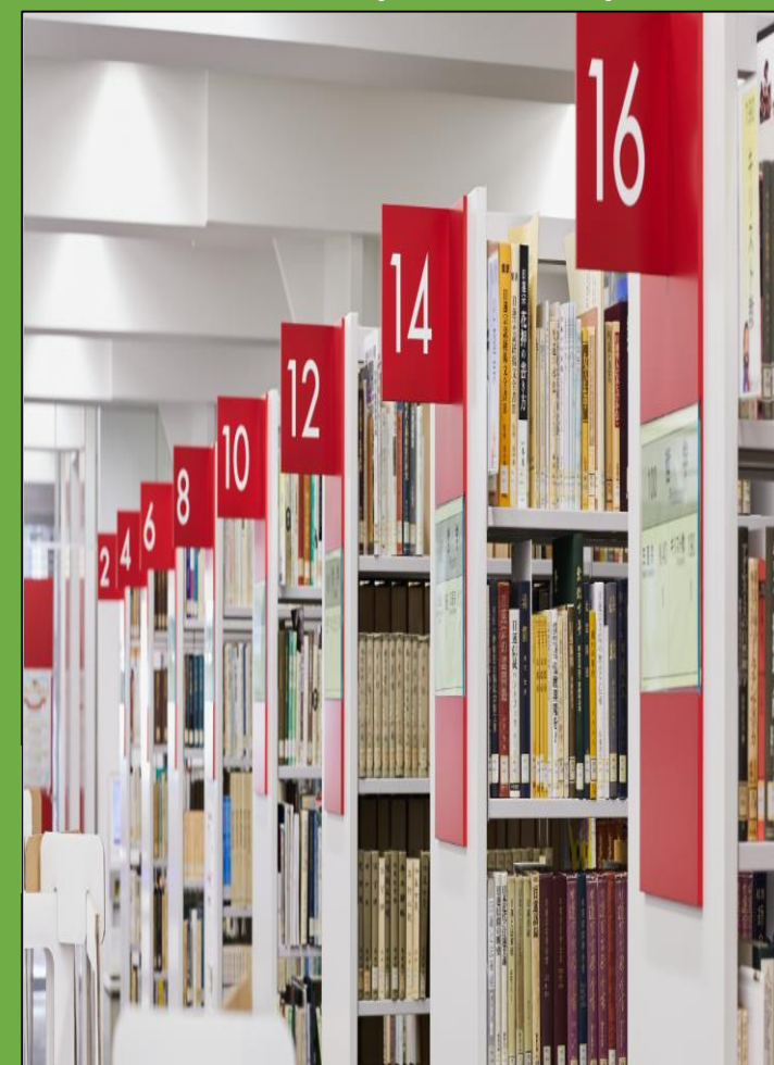
Library of Shinagawa Campus